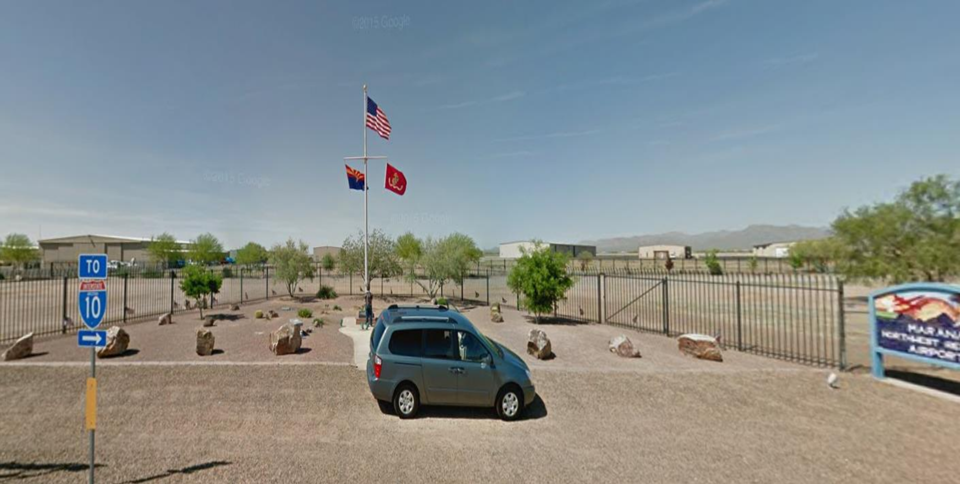
Current view of roadside Nighthawk-72 Memorial